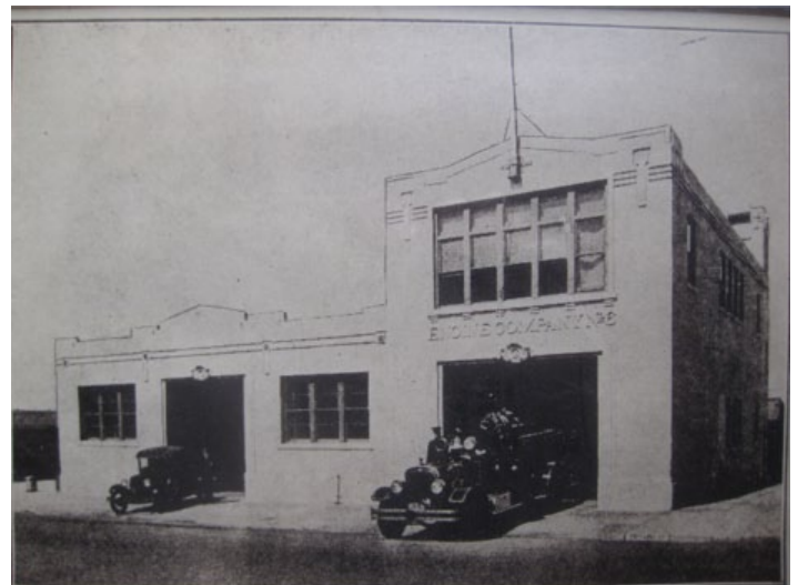
Above: SDFD Fire Station 6