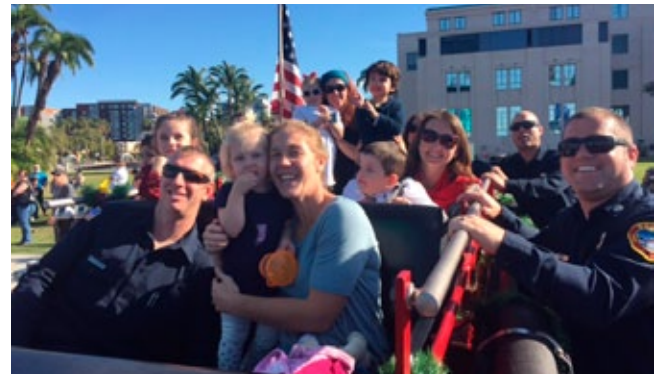
Above: Holiday Bowl Parade