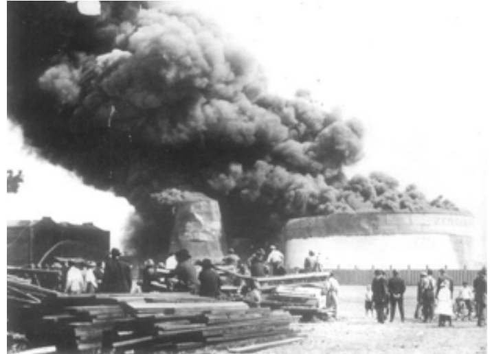
Above: The Great Standard Oil Fire

(Next, The Building of SDFD's 1st Fireboat.)