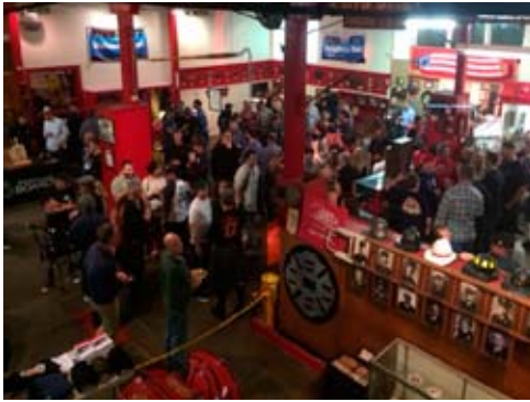
Firehouse World Networking Event at the Firehouse Museum