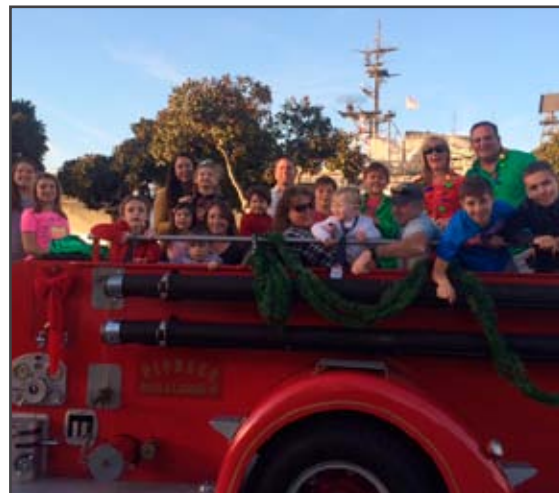
Kids enjoying a truck ride on St. Patrick's Day