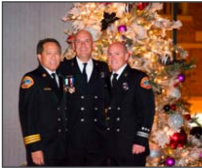
2015 Christmas Ball at the Hard Rock Hotel