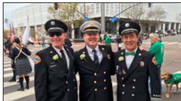
St. Patrick's Day Parade

Until next time stay safe, enjoy the spring and we hope to see you at one of our events! (Christmas Ball is tentatively scheduled for 17 December 2016)