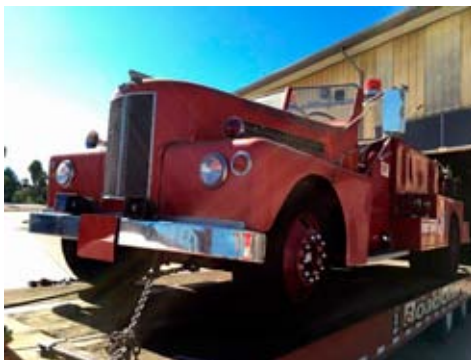
“Old Foam 28”

I hope to see you at our upcoming Movie Night!